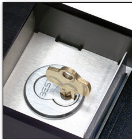
Key & Card