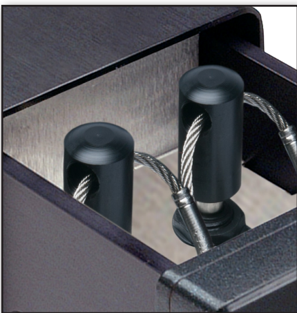
One or Two Fobs